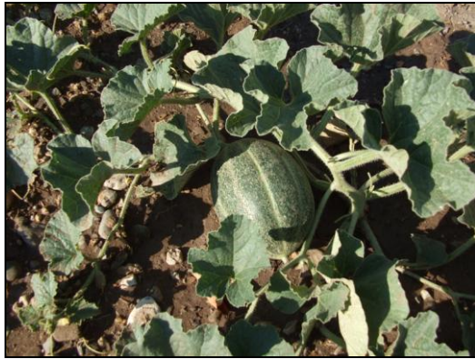
A CANTALOUPE GROWING IN A HOME GARDEN

Wherever you live, it would be fun to try growing melons. At the very least, you will probably see the flowers that form and perhaps even get to watch the melons themselves form. And if you are very, very fortunate, a sweet taste of homegrown melon may be yours.