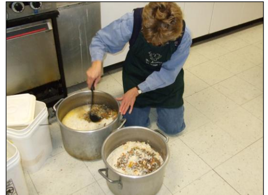
PLENTY OF WILD RICE SOUP FOR ALL!

Soup truly warms the souls of this church family.